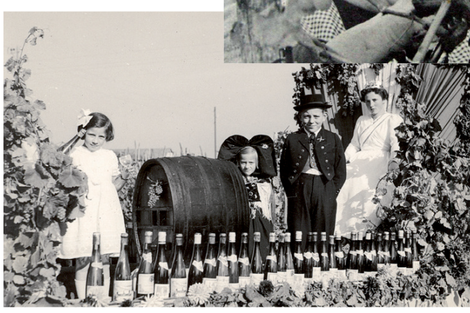
A village winegrower festival